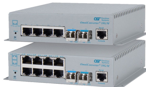
SFPs not included

The compact OmniConverter 10G/M Ethernet switches can be wall mounted, rack mounted using a shelf or DIN-rail mounted using DIN-rail mounting clips. The OmniConverter Ethernet switch models are available with 2-Pin DC Terminal or external 100-240V AC power adapters.