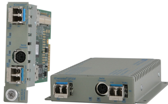
SFPs not included

VLAN 802.1ad tunneling technology enables service providers to offer their customers E-Line services via Ethernet Virtual Circuits (EVC). The 802.1p Quality of Service (QoS) prioritization standard enables delivery of high-priority, real-time applications such as voice and video over Ethernet.